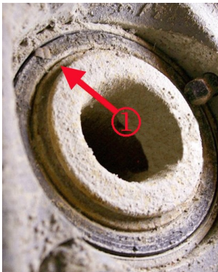
(1.) Sample Debris

1. Based on the specific EBCM module Wheel Speed Sensor DTC code; inspect the appropriate corner magnetic encoder ring for possible debris.